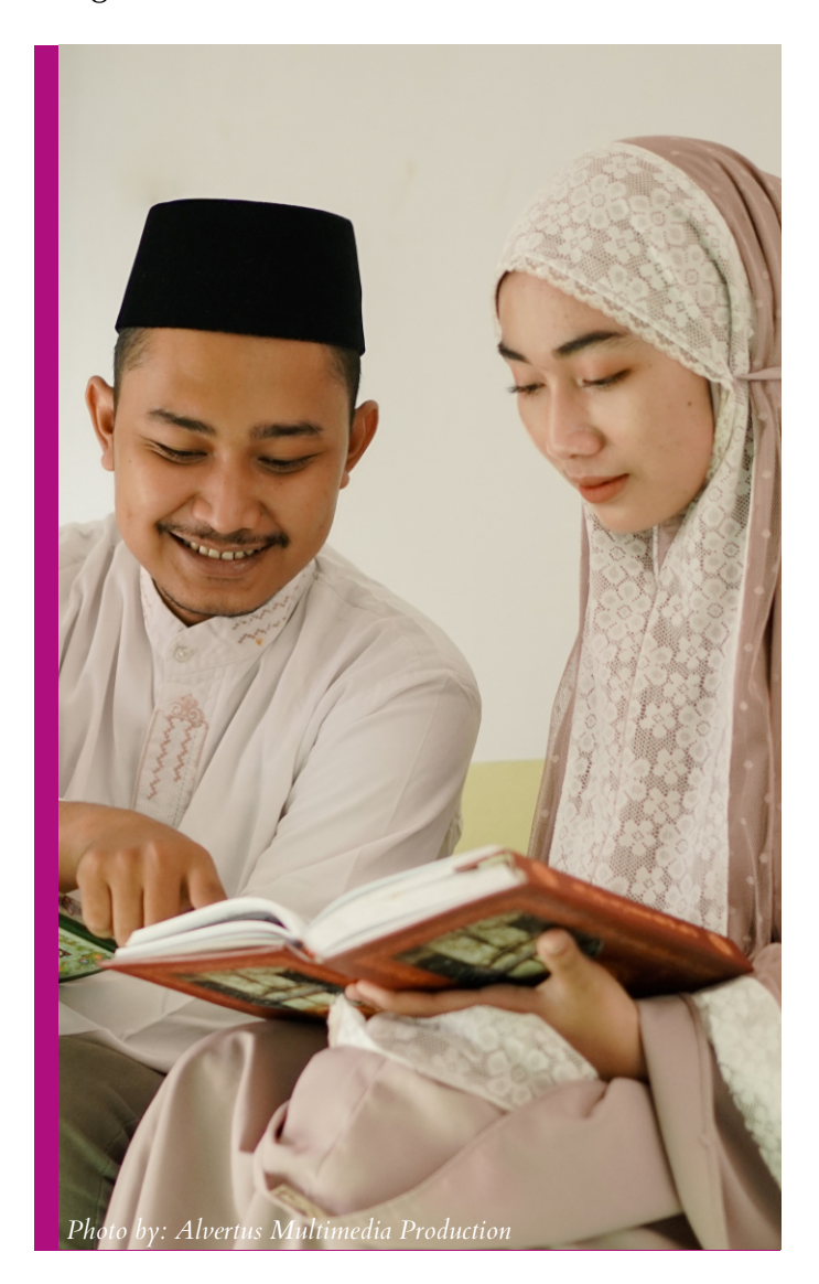
Women of BARMM | PAGE 33

women inclusion in the normalisation process. Women who are aware of, participating in Bangsamoro political matters, and those who agreed that women are included in the normalisation process are also those who have relatively higher well-being scores. This finding means that the higher the well-being of women -as an indicator of greater gender equalitythe more actively they participate in the affairs of the family, community, society and government. It also implies that while the peace process has enabled some level of women empowerment to take some roots, the region still has a long way to go towards gender equality, which is an important pre-condition in building sustainable peace in the Bangsamoro region in the future.