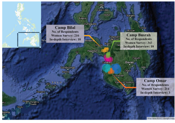
● Camp Rajamuda ● Camp Bad'r ● Camp Abubakar ● Camp Omar ● Camp Bilal ● Camp Busrah Figure 1. Major camps of the Moro Islamic Liberation Front (MILF) and study sites

This study covers three (3) of the six (6) MILF camps—Camp Omar in Maguindanao province, Camp Busrah in Lanao del Sur, and Camp Bilal in Lanao del Norte (Figure 1). Unlike the common features of state military camps that bear proper markings and delineation, the MILF camps are similar to a community with unclear boundaries.