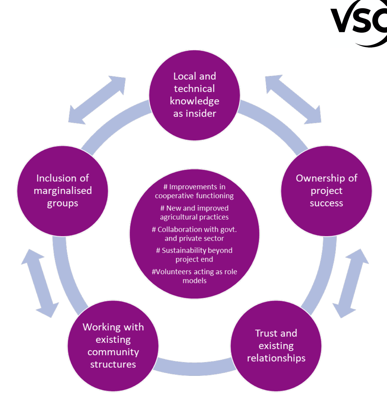
Figure 6: Contribution of community volunteers, and in IMA4P specifically