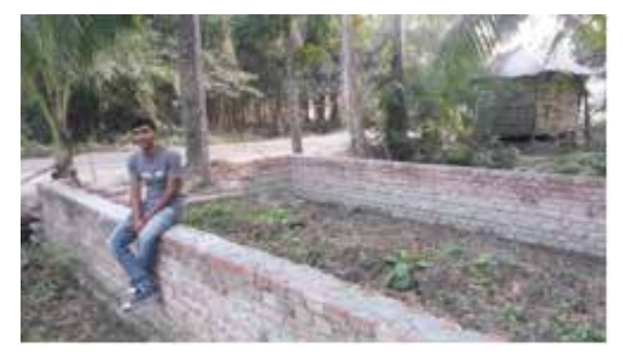
Youth club building waiting completion

"A one-year project is too short and leaves uncertainty for the youth clubs. They reach level 2 on a 1-5 capacity scale where we want them to reach level 5 and become independant institutions. It leaves the youth clubs with uncertainty. They continue but are scattered and have less structure than they did during the ICS project." - VSO Bangladesh staff