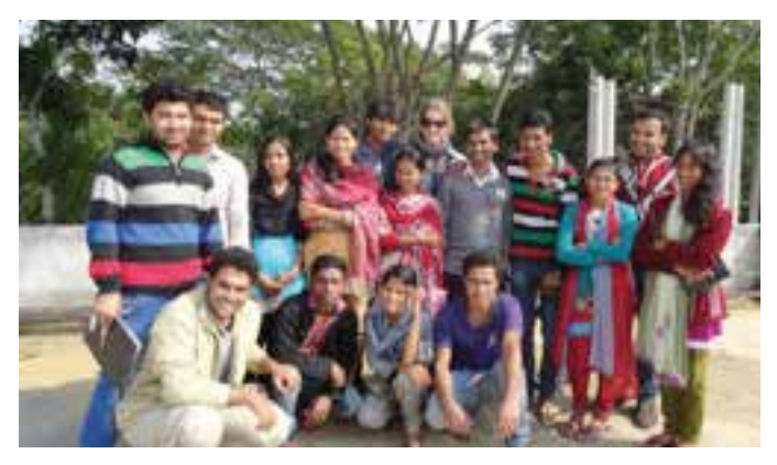
Volunteers use artwork to express their understanding of active citizenship