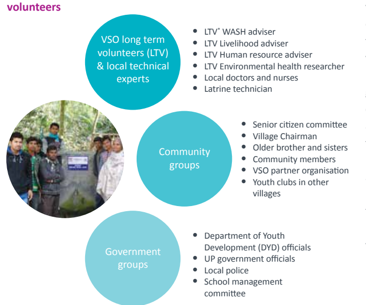
Figure 3. Network of advisers and supporters built by youth

A number of qualities in young people were highlighted as key for enabling youth volunteering work and network building in particular. These were identified as creativity, will power, passion, innovation, energy, enthusiasm, flexibility, and curiosity :