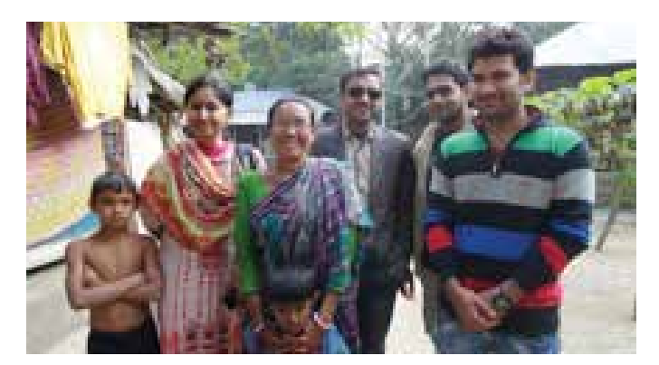
School management committee, Renaissance and VSO staff

"Local youths are better volunteers since ICS. They have a platform for discussions they have created themselves. Before ICS they were not organised but now they are united." - Partner organisation staff